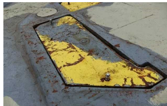
Figure 2. - Retracted shark jaws on Bourbon Rhesos 3

During anchor handling activities, the manufacturer recommends maintenance of the shark jaws to be carried out once every week. One maintenance item is to remove the inspection covers at the side of the housing and to clean and remove sand, mud or any obstructions from