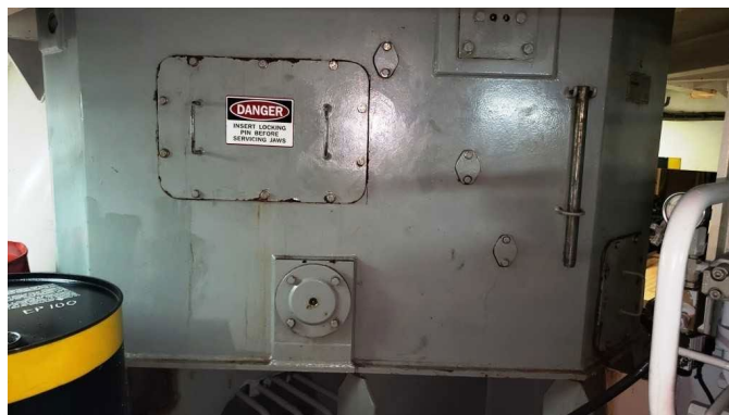
Figure 3. – Shark jaws inspection cover on Bourbon Rhesos 4

the inside of the housing frame. Upon completion of the maintenance, the inspection covers are to be installed with silicone sealant / gasket.